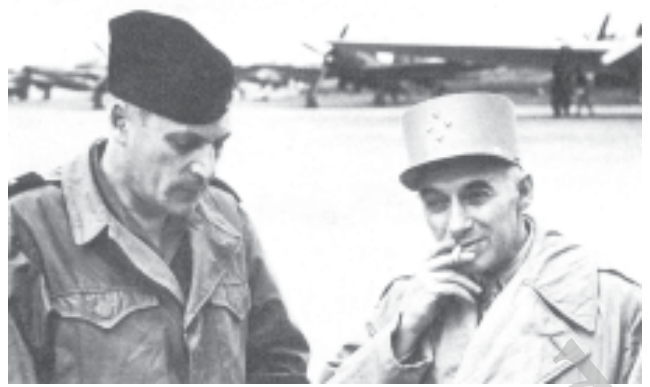
Fig. 10 – The French Commander in Indo-China, General Henri Navarre (right).

With the help of the Ho Chi Minh government in the north, the NLF fought for the unification of the country. The US