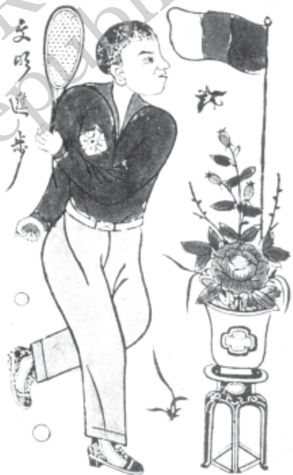
Fig. 6 – A local caricature ridiculing the Vietnamese who has been westernised. Abandoning his own culture, he has begun wearing Western clothes and playing tennis.