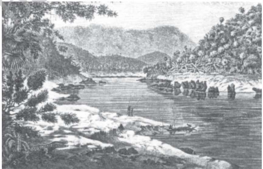
Fig. 4 – The Mekong river, engraving by the French Exploratory Force, in which Garnier participated.

French troops landed in Vietnam in 1858 and by the mid-1880s they had established a firm grip over the northern region. After the Franco-Chinese war the French assumed control of Tonkin and Anaam and, in 1887, French Indo-China was formed. In the following decades the French sought to consolidate their position, and people in Vietnam began reflecting on the nature of the loss that Vietnam was suffering. Nationalist resistance developed out of this reflection.