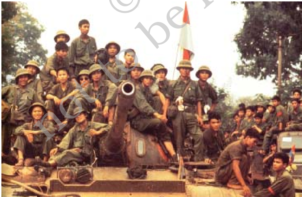
Fig. 21 – Vietcong soldiers pose triumphantly atop a tank after Saigon is liberated. What does this image tell us about the nature of Vietnamese nationalism?