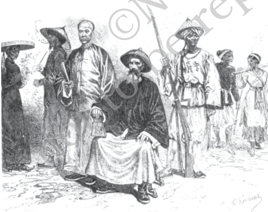
Fig. 5 – A French weapons merchant, Jean Dupuis, in Vietnam in the late nineteenth century.

Indentured labour – A form of labour widely used in the plantations from the mid-nineteenth century. Labourers worked on the basis of contracts that did not specify any rights of labourers but gave immense power to employers. Employers could bring criminal charges against labourers and punish and jail them for non-fulfilment of contracts.