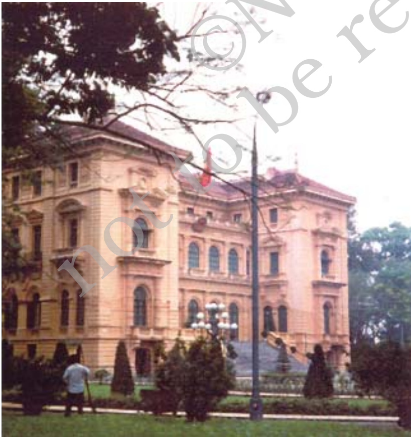
Fig. 7 – Modern Hanoi. Colonial buildings like this one came up in the French part of Hanoi.

The French part of Hanoi was built as a beautiful and clean city with wide avenues and a well-laid-out sewer system, while the 'native