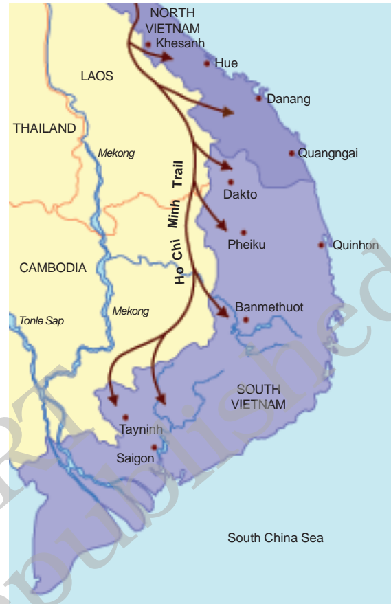
Fig. 14 – The Ho Chi Minh trail. Notice how the trail moved through Laos and Cambodia.

Most of the trail was outside Vietnam in neighbouring Laos and Cambodia with branch lines extending into South Vietnam. The US regularly bombed this trail trying to disrupt supplies, but efforts to destroy this important supply line by intensive bombing failed because they were rebuilt very quickly.