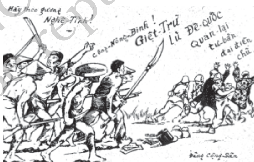
Fig. 9 – Cartoon of Vietnamese nationalists chasing away imperialists. In all such nationalist representations of struggle the nationalists appear heroic, marching ahead, while the imperial forces flee.

Soon, however, the anti-imperialist movement in Vietnam came under a new type of leadership.