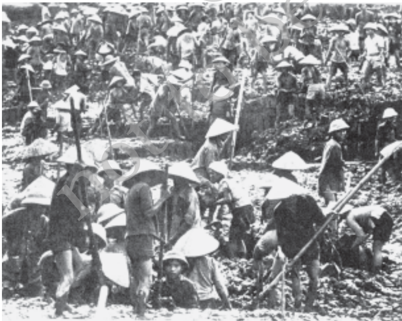
Fig. 15 – Rebuilding damaged roads. Roads damaged by bombs were quickly rebuilt.