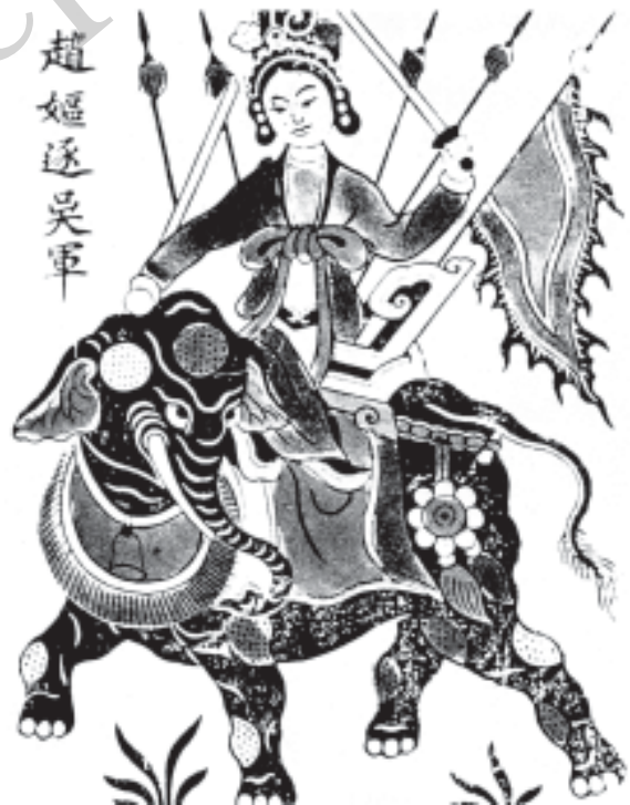
Fig. 17 – Image of Trieu Au worshipped as a sacred figure.

Other women rebels of the past were part of the popular nationalist lore. One of the most venerated was Trieu Au who lived in the third century CE. Orphaned in childhood, she lived with her brother. On growing up she left home, went into the jungles, organised a large army and resisted Chinese rule. Finally, when her army was