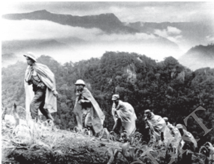
Fig. 16 – On the Ho Chi Minh trail.