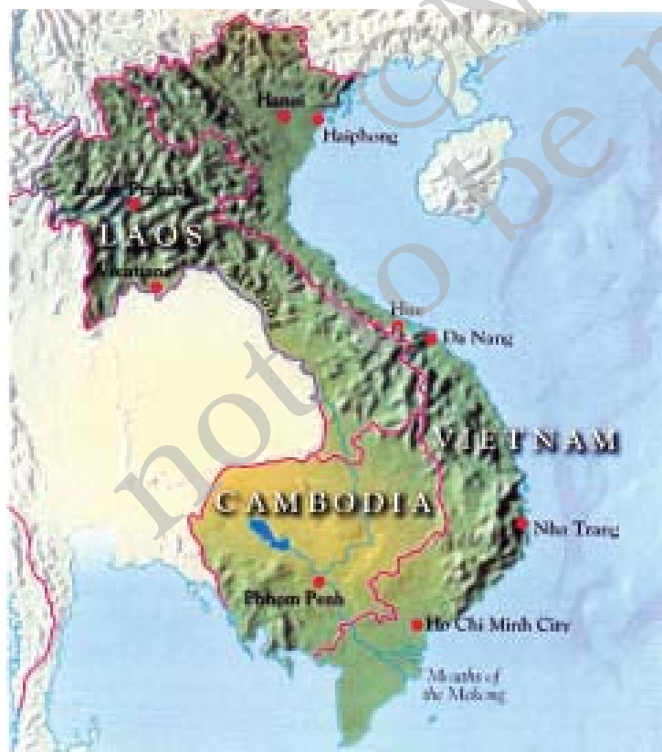
Fig. 1 – Map of Indo-China.

If you see the historical experience of Indo-China in relation to that of India, you will discover important differences in the way colonial empires functioned and the anti-imperial movement developed. By looking at such differences and similarities you can understand the variety of ways in which nationalism has developed and shaped the contemporary world.