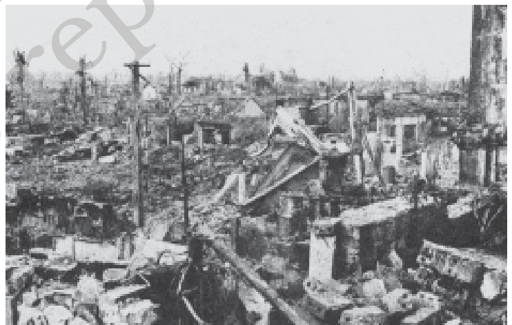
Fig. 13 – In December 1972 Hanoi was bombed.

The tonnage of bombs, including chemical arms, used during the US intervention (mostly against civilian targets) in Vietnam exceeds that used throughout the Second World War.