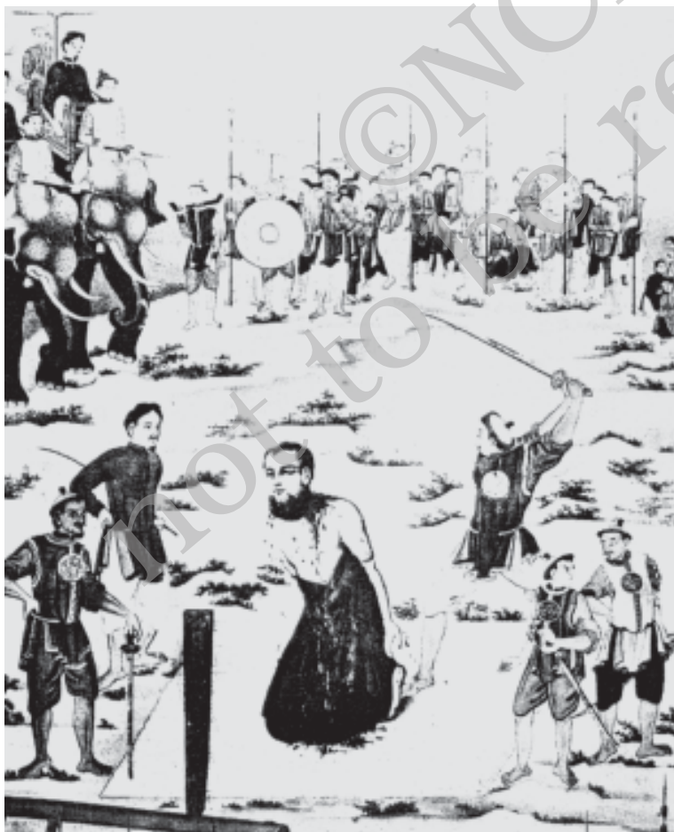
Fig. 8 – The execution of Father Borie, a Catholic missionary. Images like this by French artists were publicised in France to stir up religious fury.

Confucius (551-479 BCE), a Chinese thinker, developed a philosophical system based on good conduct, practical wisdom and proper social relationships. People were taught to respect their parents and submit to elders. They were told that the relationship between the ruler and the people was the same as that between children and parents.