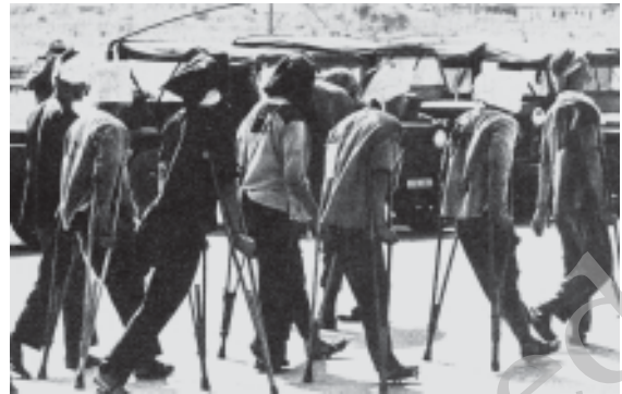
Fig. 20 – North Vietnamese prisoners in South Vietnam being released after the accord.

The widespread questioning of government policy strengthened moves to negotiate an end to the war. A peace settlement was signed in Paris in January 1974. This ended conflict with the US but fighting between the Saigon regime and the NLF continued. The NLF occupied the presidential palace in Saigon on 30 April 1975 and unified Vietnam.