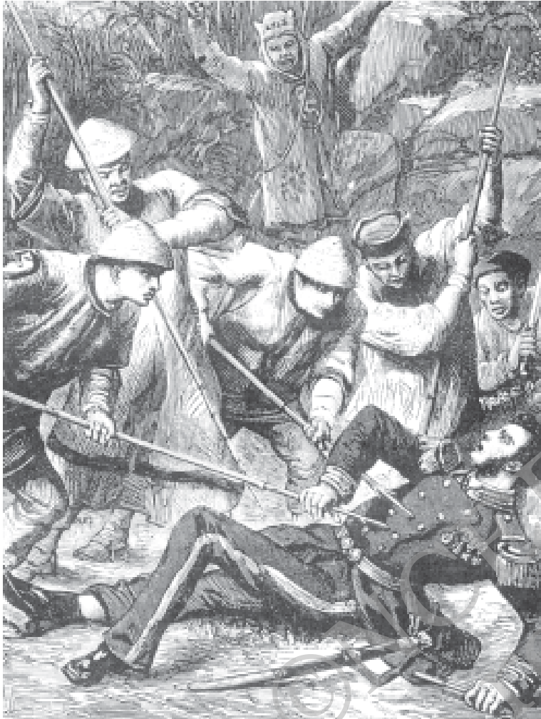
Fig. 3 – Francis Garnier, a French officer who led an attack against the ruling Nguyen dynasty, being killed by soldiers of the court.

Garnier was part of the French team that explored the Mekong river. In 1873 he was commissioned by the French to try and establish a French colony in Tonkin in the north. Garnier carried out an attack on Hanoi, the capital of Tonkin, but was killed in the fight.