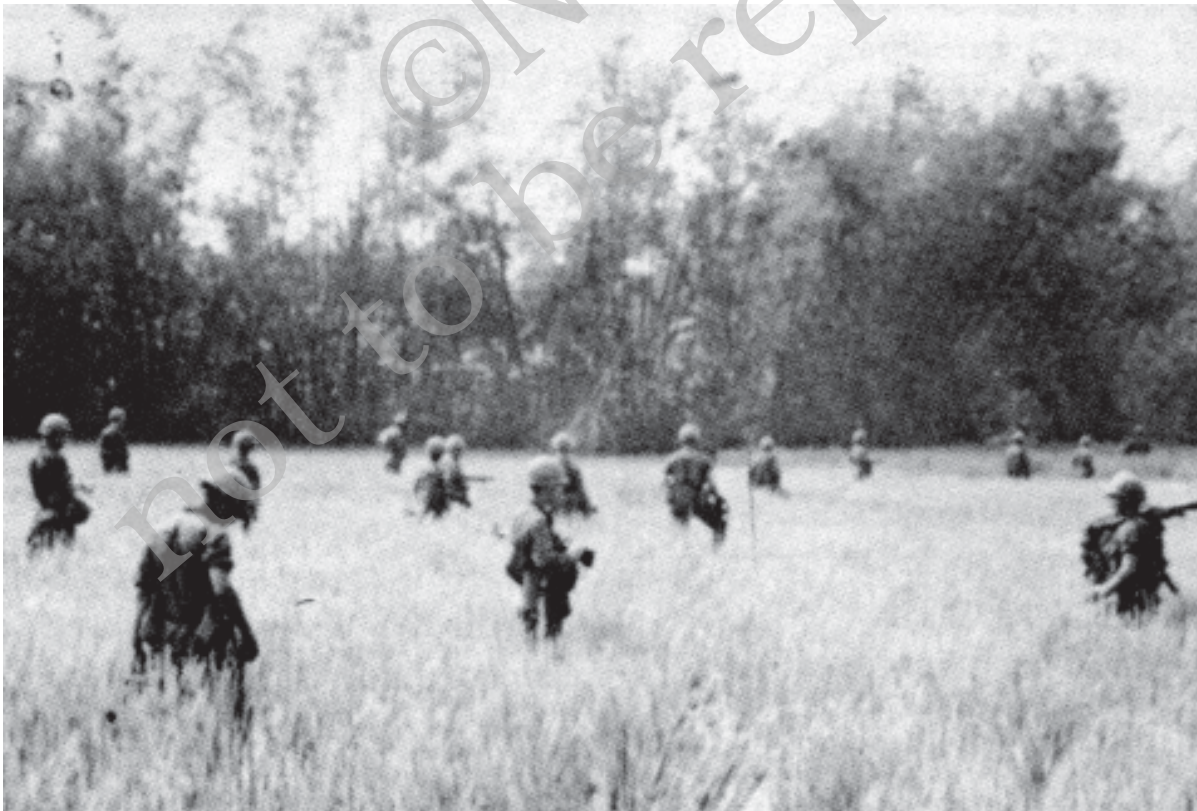
Fig. 12 – American soldiers searching rice fields for Vietcongs.

US entry into the war marked a new phase that proved costly to the Vietnamese as well as to the Americans. From 1965 to 1972, over 3,403,100 US services personnel served in Vietnam (7,484 were women). Even though the US had advanced technology and good