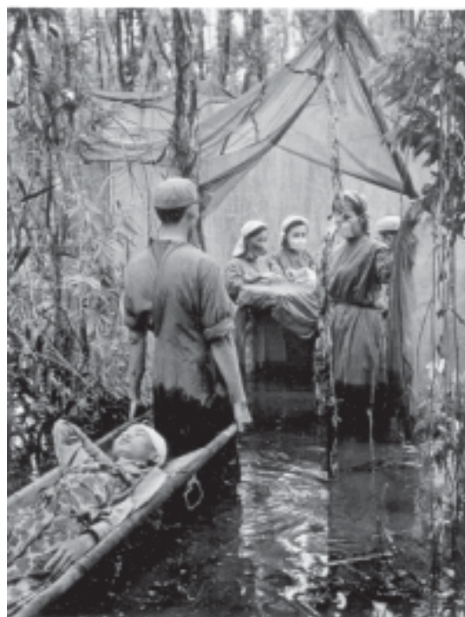
Fig. 19 – Vietnamese women doctors nursing the wounded.