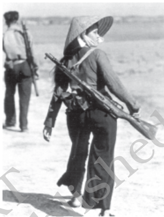
Fig. 18 – With a gun in one hand. Stories about women showed them eager to join the army. A common description was: 'A rosy-cheeked woman, here I am fighting side by side with you men. The prison is my school, the sword is my child, the gun is my husband.'

By the 1970s, as peace talks began to get under way and the end of the war seemed near, women were no longer represented as warriors. Now the image of women as workers begins to predominate. They are shown working in agricultural cooperatives, factories and production units, rather than as fighters.