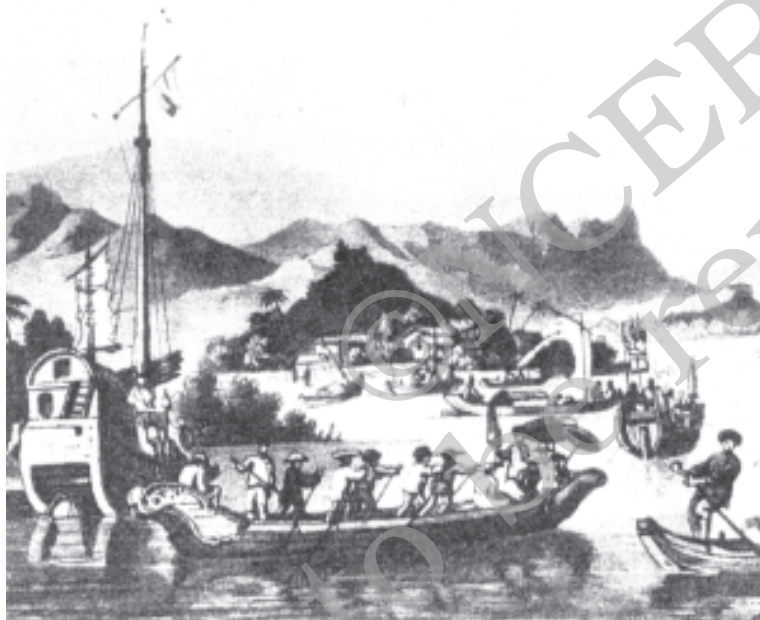
Fig. 2 – The port of Faifo.

Vietnam was also linked to what has been called the maritime silk route that brought in goods, people and ideas. Other networks of trade connected it to the hinterlands where non-Vietnamese people such as the Khmer Cambodians lived.